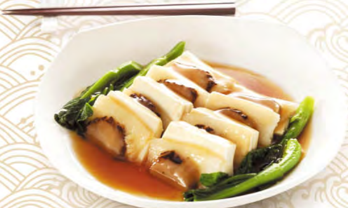
1106 竹筴麒麟豆腐 Stewed Bean Curd with Bamboo Pith & Mushroom

1104 涼瓜海皇玉芙蓉 $ 238 Scrambled Egg White with Seafood & Bitter Melon