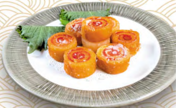
912 大良野雞卷 Crispy Marinated Pork Rolls