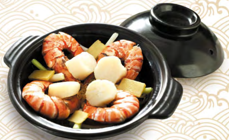
401 粉絲玉帶大蝦煲 Sautéed Prawn & Scallop with Green Bean Noodles