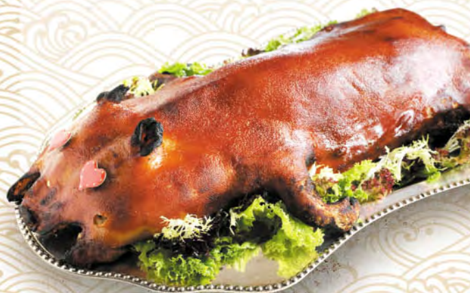
103 化皮乳豬 Roast Sliced Suckling Pig

113 椒鹽豆腐角 $ 98 Deep-fried Diced Bean Curd in Spicy Salt & Pepper