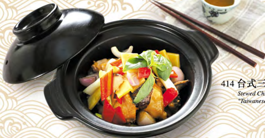
414 台式三杯雞煲 Stewed Chicken in "Taiwanese Style"