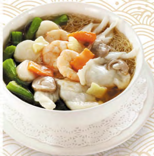
1202 粵軒窩麵 Soup Noodles in "Canton Room Style"

1206 乾炒牛河 $ 188 Fried Rice Noodles with Beef & Bean Sprouts