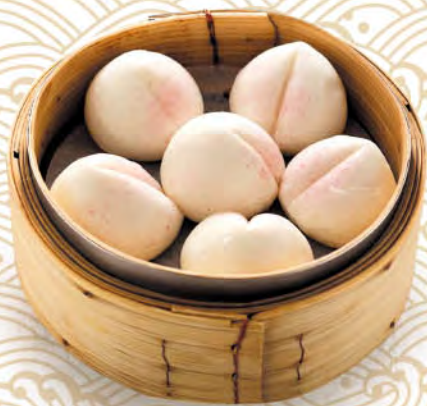
1506 賀壽蟠桃 (小) Chinese Birthday Bun (Small)