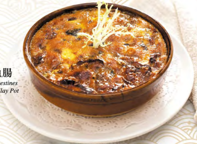
913 砵仔焗魚腸 Baked Fish Intestines with Eggs in Clay Pot