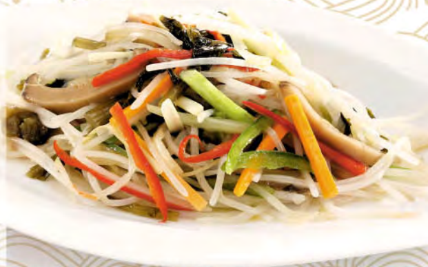
1007 雪菜榨菜絲炒銀芽 Sautéed Bean Sprouts with Shredded Preserved Vegetable