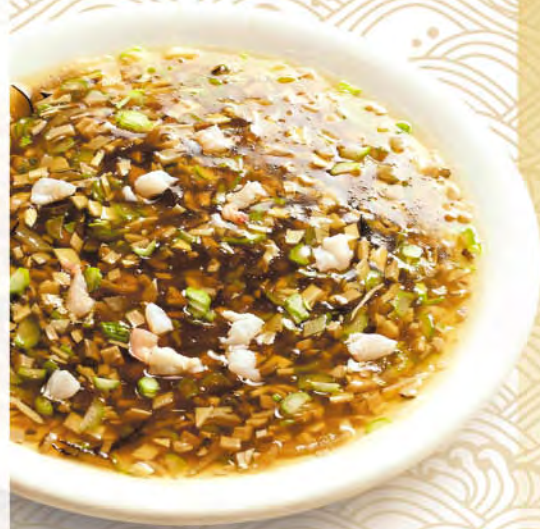
302 龍皇海參羹 Shredded Sea Cucumber Soup with Seafood

304 韭黃瑤柱羹 $ 98 $ 368 Shredded Conpoy Soup with Yellow Chives