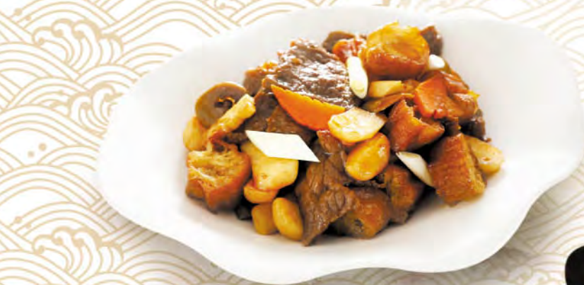
914 鬼馬炒牛肉 Sliced Beef with Fried Bread Stick