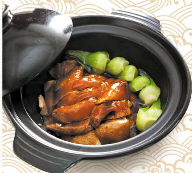
705 瓦罉花雕玫瑰雞 Steamed Chicken with Chinese Wine Sauce in Casserole

704 當紅脆皮雞 $ 280 Deep-fried 半隻 Crispy Chicken Half Bird