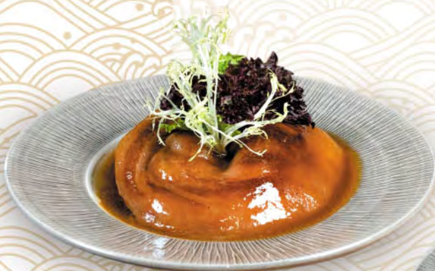
904 大紅袍元蹄 Braised Pork Knuckle in "Da Hong Pao" Tea Flavour