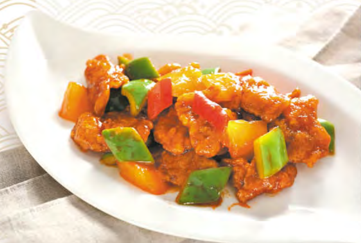
607 果香咕嚕肉 Sweet & Sour Pork with Fruit

612 鹹蛋蒸肉餅 $ 178 Steamed Minced Pork with Salted Egg