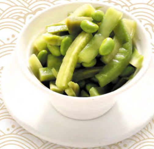
1503 開胃小食 Appetizer