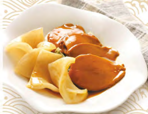
203 蠔皇花膠鮮鮑片 Braised Sliced Abalone with Fish Maw in Oyster Sauce

209 蝦籽燒海參 $ 508 六件 Six Pieces Braised Sea Cucumber with Shrimp Roe