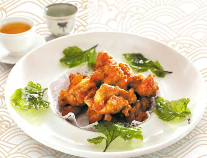
710 乳香碎炸雞 Deep-fried Chicken with Fermented Red Bean Curd

710 乳香碎炸雞 $ 188 Deep-fried Chicken with 例牌 Fermented Red Bean Curd Standard