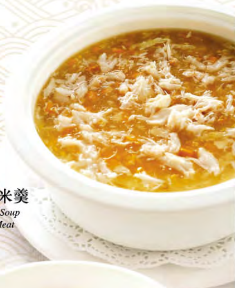
308 蟹肉粟米羹 Sweet Corn Soup with Crab Meat