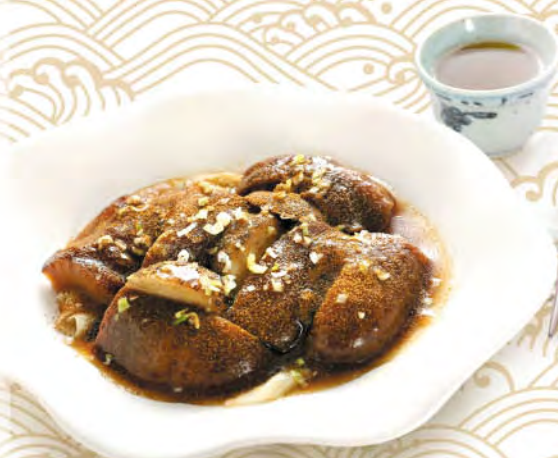
205 蠔皇花膠鵝掌 Braised Goose Web with Fish Maw in Oyster Sauce