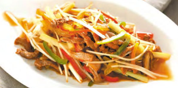
504 七彩牛柳絲 Sautéed Shredded Beef with Assorted Pepper

506 紫羅牛肉 $ 208 Sautéed Beef with Pineapple & Pickled Ginger