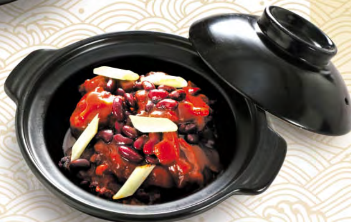
411 紅酒腰豆牛尾煲 Braised Oxtails & Beans in Red Wine Sauce