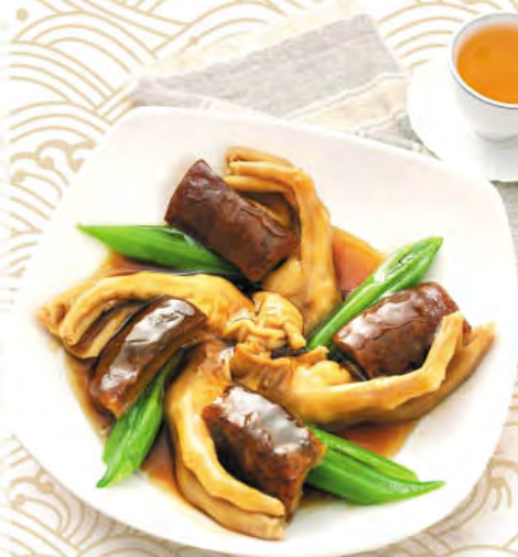
204 海參鮮鮑片 Braised Sliced Abalone with Sea Cucumber