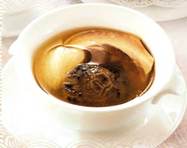
305 北菇肘子燉菜膽湯 Double-boiled Black Mushroom with Yunnan Ham & Cabbage