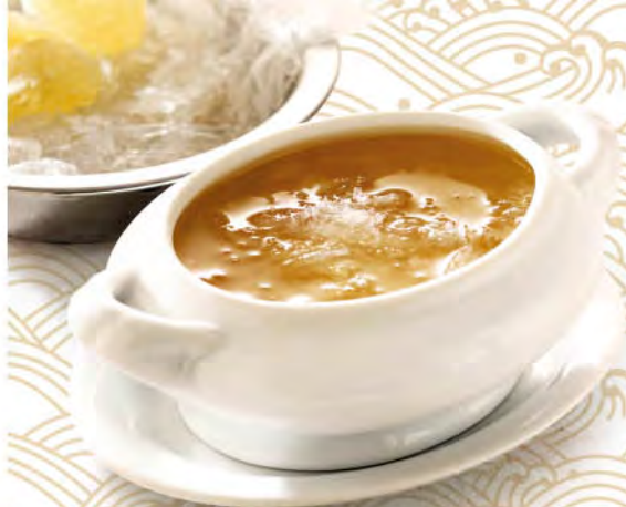
1403 冰花燉燕窩 Sweetened Bird's Nest Cream

1409 合時鮮果盤 $ 60 Fresh Fruit Platter 每位 Per Person