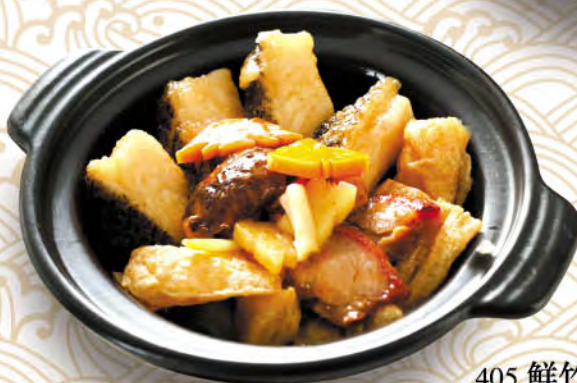
405 鮮竹銀鱈魚煲 Braised Black Cod & Bean Curd Skin