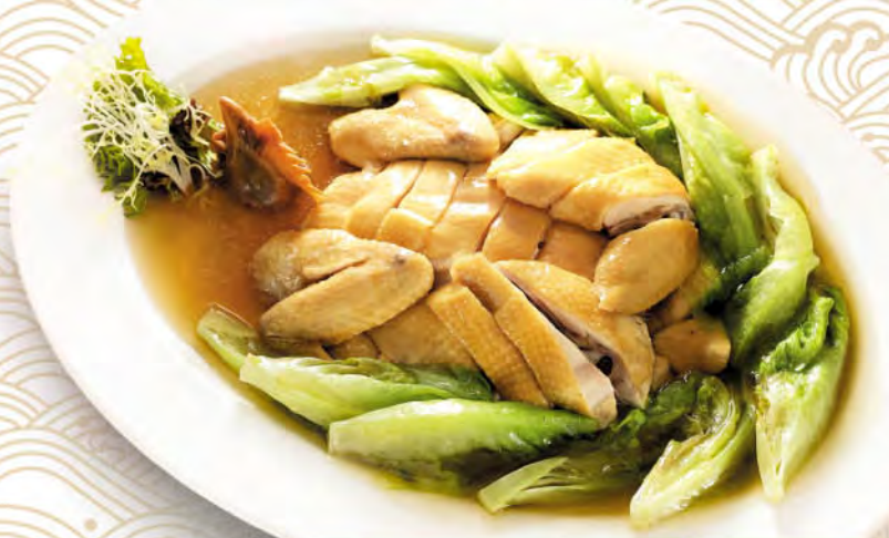
707 菜膽上湯雞 Stewed Chicken with Vegetable