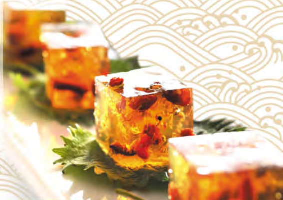
1407 杞子桂花糕 Chinese Pudding with Sweet Osmanthus & Goji Berry