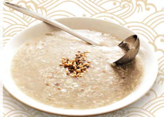
906 鷓鴣粥 Partridge Broth