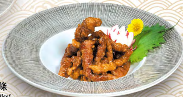
907 掛爐牛柳條 Fried Shredded Beef in "Chinese Style"