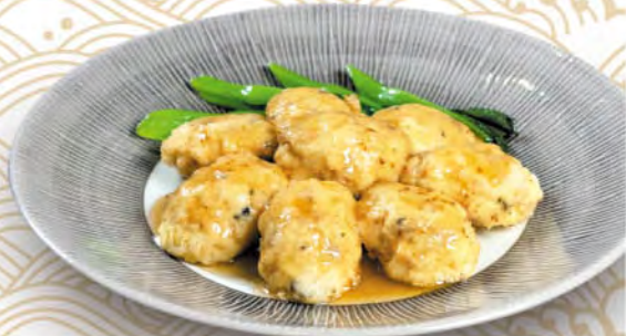
911 香煎琵琶豆腐 Wok-fried Minced Shrimps and Bean Curd