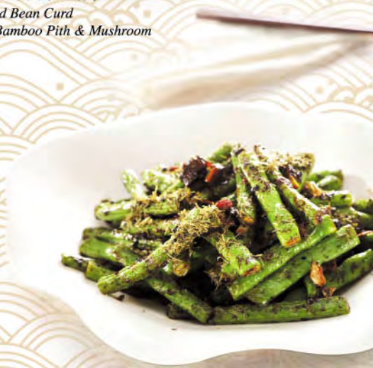
1108 刁草麵醬欖角四季豆 Stir-fried String Bean with Preserved Bean Sauce & Dill

1108 刁草麵醬欖角四季豆 $ 148 Stir-fried String Bean with Preserved Bean Sauce & Dill