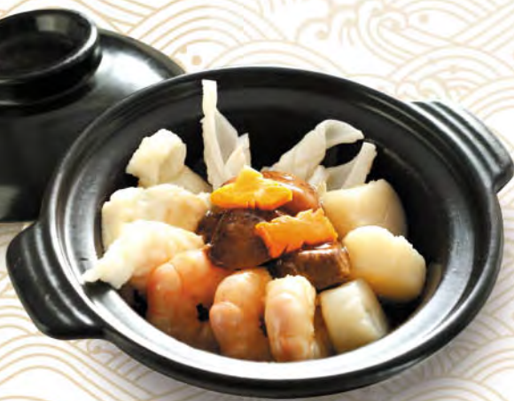
403 粵軒一品煲 Assorted Seafood in "Canton Room Style"

410 魚香茄子煲 $ 168 Sautéed Egg Plant with Minced Pork