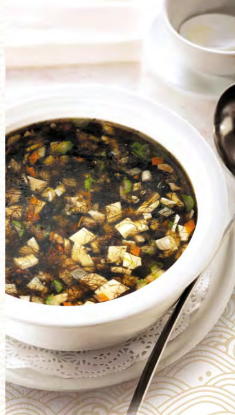
1102 翡翠髮菜豆腐羹 Bean Curd Soup with Vegetable & Blackmoss

例牌 Standard 1101 四季素翅羹 $ 268 Mushroom with Fungus & Bamboo Pith Broth