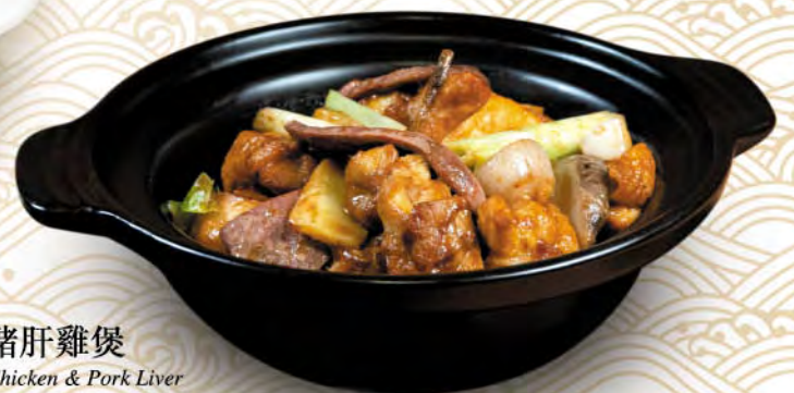
910 薑蔥豬肝雞煲 Stewed Chicken & Pork Liver with Ginger and Spring Onion