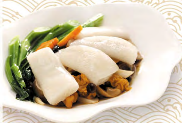
1001 竹筍鼎湖上素 Assorted Vegetable with Bamboo Pith

1009 蒜香蒸茄子 $ 138 Steamed Egg Plant with Minced Garlic