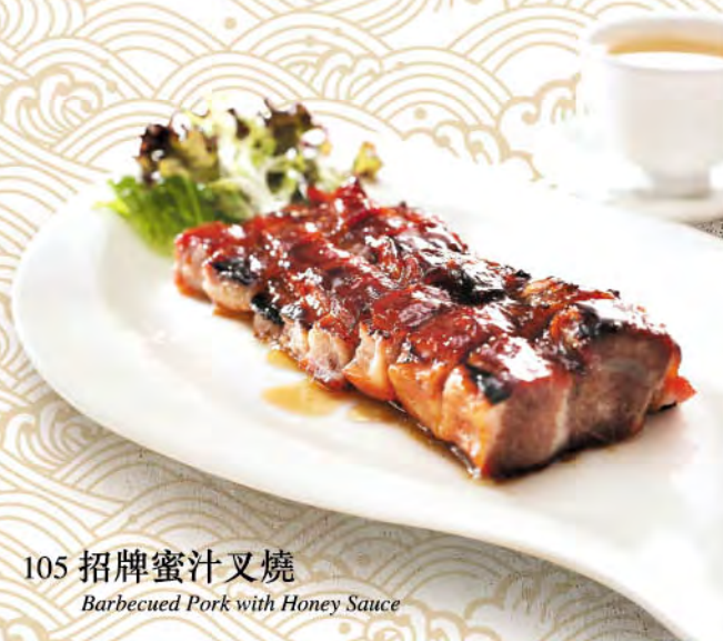
105 招牌蜜汁叉燒 Barbecued Pork with Honey Sauce