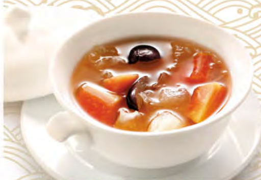
1404 萬壽果燉雪耳 Double-boiled Papaya with Snow Fungus