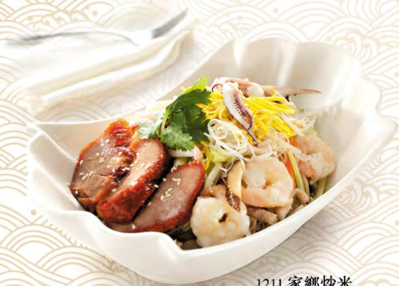
1211 家鄉炒米 Fried Vermicelli in "Country Style"

1212 星洲炒米 $ 188 Fried Vermicelli in "Singapore Style"