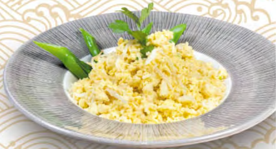
909 桂花炒魚肚 Scrambled Eggs with Fish Maw