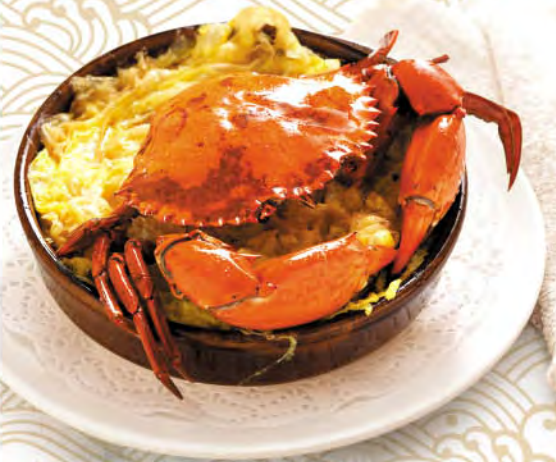
905 台山焗蟹砵 Baked Crab in Clay Pot

908 荔茸香酥鴨 $ 250 Crispy Fried Duck with Taro 半隻 Half Bird