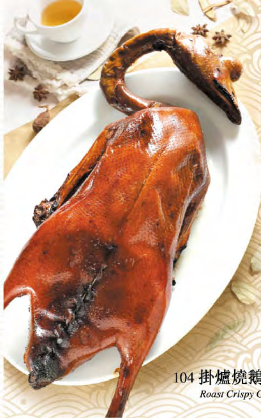
104 掛爐燒鵝 Roast Crispy Goose