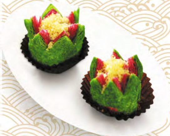
1406 富貴牡丹酥 Baked Lotus Seed Paste