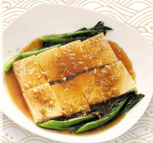
1004 蝦籽蒸豆腐 Steamed Bean Curd with Shrimp Roe