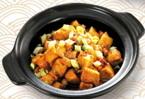
415 鹹魚雞粒豆腐煲 Sautéed Diced Chicken & Bean Curd with Salty Fish