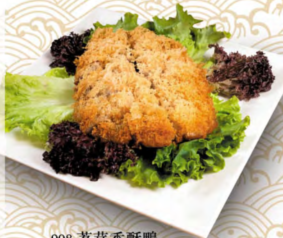
908 荔茸香酥鴨 Crispy Fried Duck with Taro